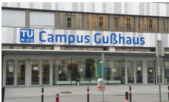
(C) Campus Gußhaus, Venue of FraMCoS XII