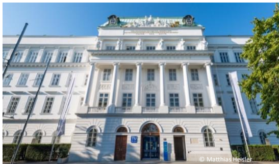
(A) Main Building of TU Wien, Venue of Welcome Cocktail